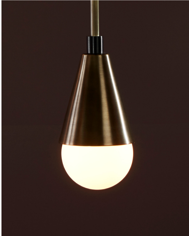
AGED BRASS / BLACKENED BRASS