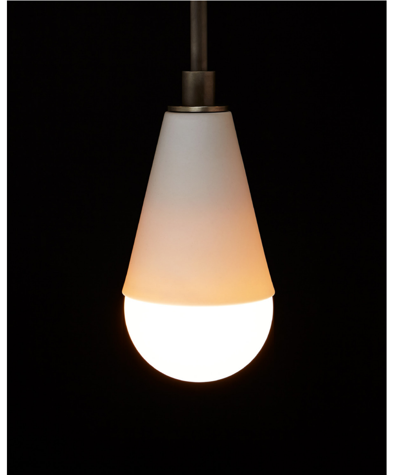
AGED BRASS / PORCELAIN