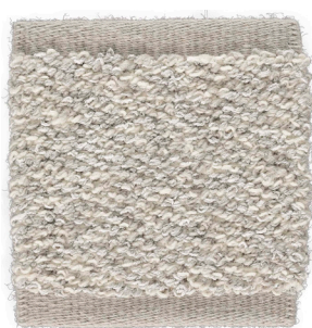
Soft Grey 850-8005