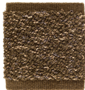
Bark Green 301