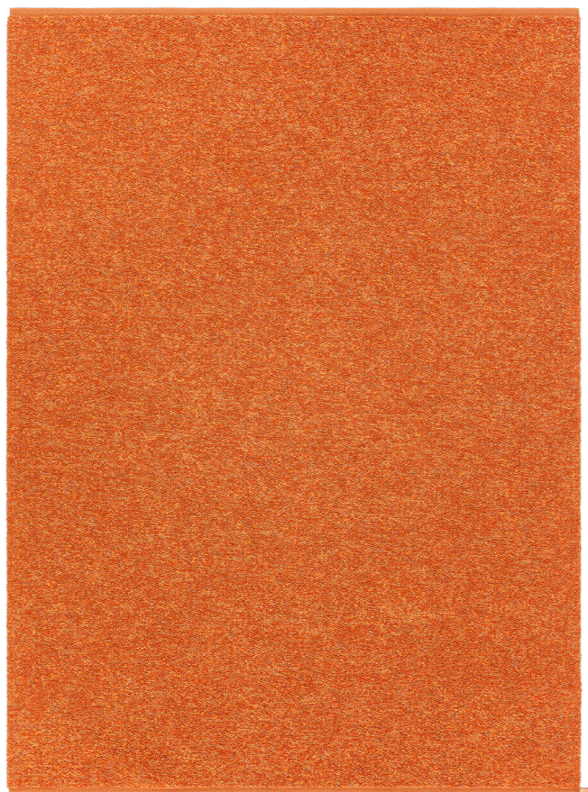
Rug 170x240 cm, Tangerine Orange 441