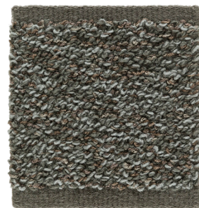
Ash Grey 551