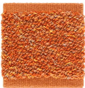
Tangerine Orange 441