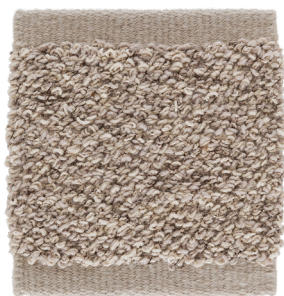
Powder Greige 804