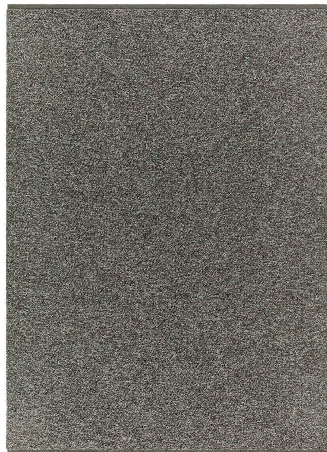
Rug 170x240 cm, Ash Grey 551